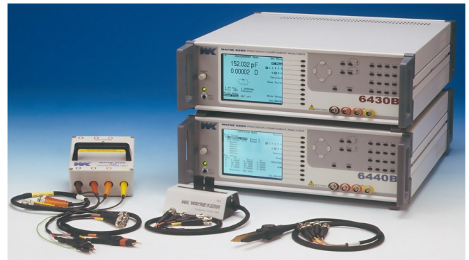
Accurate component analysis to 500 kHz (6430B) or 3 MHz (6440B) is simplified by many accessories which includes Overload Protection Unit 1J1100

The protection unit will protect the test equipment from up to 25 Joules of charged energy.