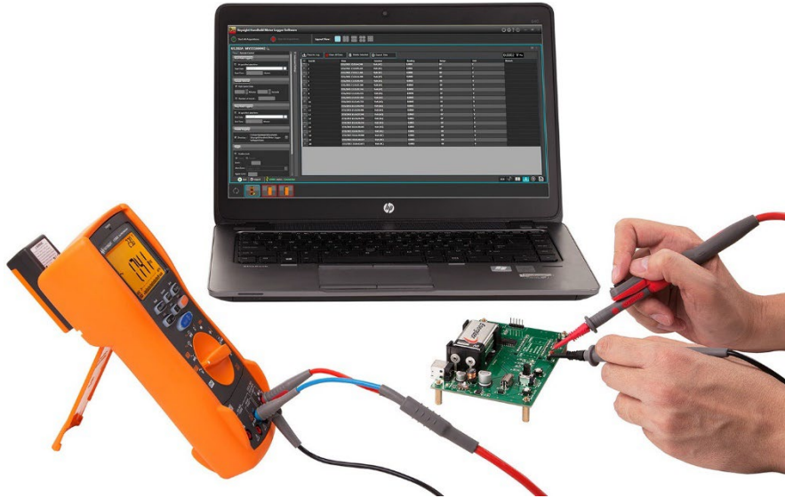
Figure 6. Data logging experience with Keysight Meter Logger software