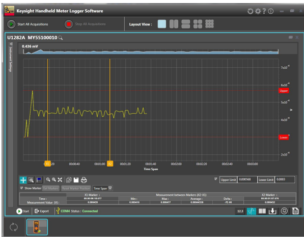
Figure 2. U1282A data log trend plot with markers and limit levels.

When it comes to the need to observe measurements over a period of time, Keysight Meter Logger software provides a comprehensive data logging experience with Keysight U1280 Series as well as other Keysight U1200 Series handheld DMMs. The handheld DMM can be easily connected to the Meter Logger software that runs on a PC via Infrared (IR)-to-USB cable, or to do so wirelessly with the optional Keysight Remote Link solution. Keysight Meter Logger software provides users the flexibility and useful configuration to log their measurements, such as the flexibility to select sample interval, enable limit levels on the data log and email notification option for when the limit is exceeded. The data log measurements can be presented either by trend plot or table format for easy interpretation and further analysis — essential for troubleshooting and commissioning tasks. Once the measurements are recorded in the software, users can transfer the logged data into various types of report formats with just a click of the button.