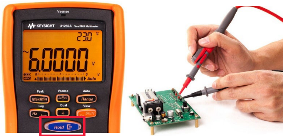
Figure 5. Hold & Export button—one press for three actions: Measure, save it into handheld DMM's memory and send the measurement out via infrared port. Optional U5404A remote switch probe emulates 'Hold & Export' button.

While data logging over a period of time is useful to capture measurements for further observations and analysis, manual data log is just as useful to conveniently record measurements and reduce human error occurrence from conventional manual data entering process. Better yet, users are able to store measurement readings into the handheld DMM's internal memory and at the same time export the measurements to the Keysight Meter Logger software or Keysight Remote Link solution via the DMM's infrared port — all of these by simply pressing the 'Hold & Export' button. When the situation requires users to concentrate on probing, the optional U5404A remote switch probe can be used to perform manual logging by emulating the 'Hold & Export' button of the U1280 Series handheld DMMs.