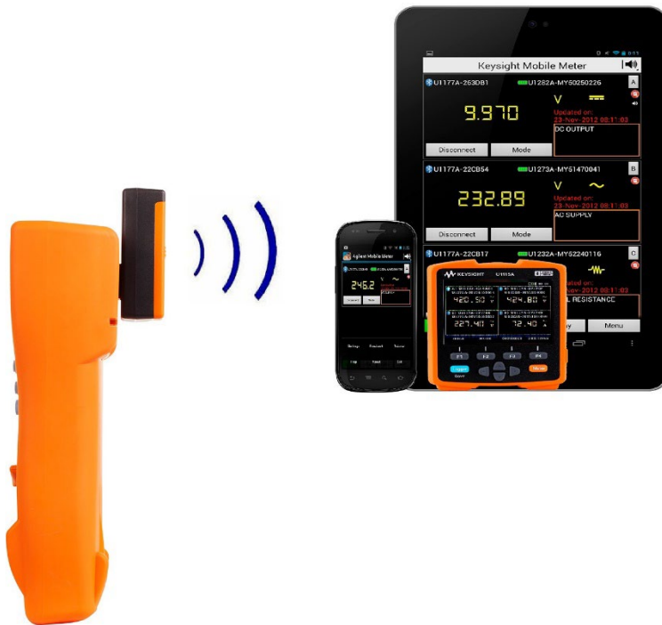
Figure 7. Pair up the U1280 series with Keysight Remote Link solution for wireless measurement option

Keysight U1280 Series comes with programmability capability that allows avid programmer to create computer programs to control the handheld DMM. The programmability of Keysight U1280 Series allows users to automate Keysight U1280 Series or even integrate into bigger test systems.