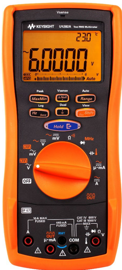
Figure 1. Large display and backlit keypad allow users to complete their jobs even in subdued lighting conditions.

Troubleshooting in most electrical environment is typically dangerous due to the high voltages involved. Now with the unique built in Vsense feature, you get a quick sense of AC voltage presence without the need to probe. When voltage presence is detected, it produces a unique combination of audible beeper alert and blinking LED light to alert users. This is especially useful to safeguard users from exposure to live wires, suspected AC voltage presence or simply an act of safety precaution before initiating a task. Work with a peace of mind knowing your safety comes first with Keysight's U1280 Series handheld DMM .