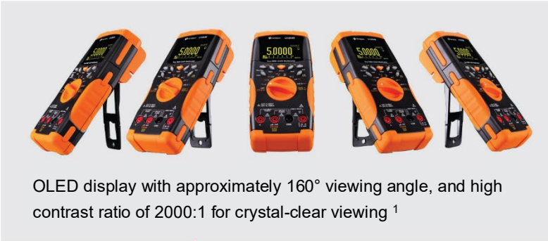
OLED display with approximately 160° viewing angle, and high contrast ratio of 2000:1 for crystal-clear viewing 1