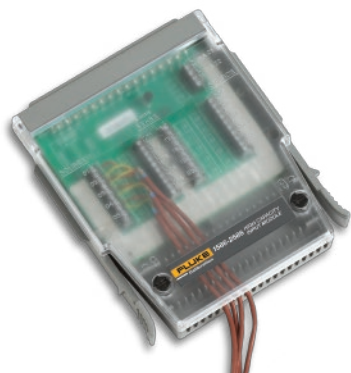
1586-2586 High-Capacity Module

For a calibration lab where accuracy is of primary importance, the Super-DAQ is best configured with a DAQ-STAQ Multiplexer. The external DAQ-STAQ features mini-jack thermocouple terminals—each with its own reference junction sensor—and patented mini-DWF, gold-plated input terminals, which accept bare wire, spade lug, or mini-banana-plug probe terminations. Easily connect and disconnect PRTs, thermistors, and thermocouples for benchtop temperature calibration. It can be stacked on the 1586A to reduce footprint in busy labs. Having the flexibility to configure the Super-DAQ for factory or lab use reduces your equipment needs and cost.