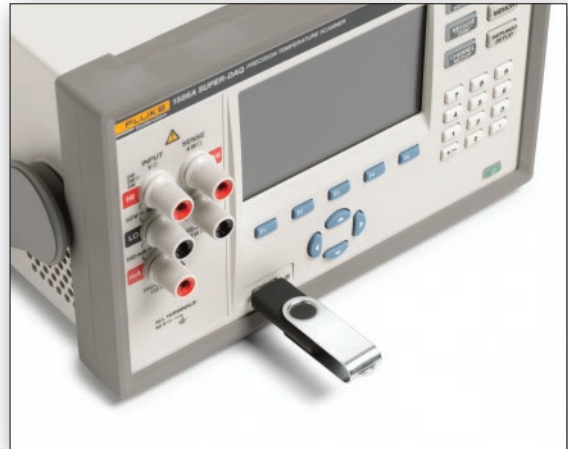
Easily transfer Super-DAQ data and setup files using a USB flash drive.

The Super-DAQ also includes two levels of data security to prevent unauthorized users from tampering with or forging test data or setup files. This security feature is especially important to industries that are regulated by government agencies where data traceability is required.