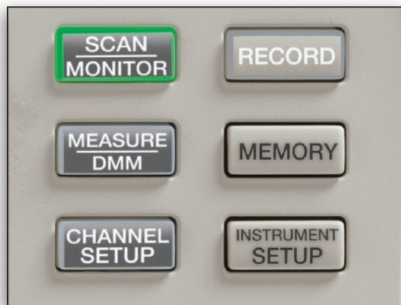
Scan, monitor, measure, and DMM function keys on the front panel.

Function keys are backlit so that you always know the mode of operation and recording status.