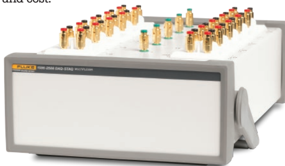
1586-2588 DAQ-STAQ Multiplexer