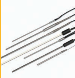
Calibrated Temperature Sensors

A wide array of accessories is available to help you maximize productivity, but the following are essential for most users.