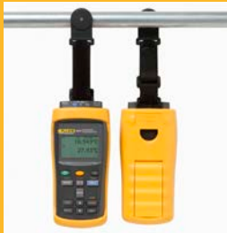
TPAK Meter Hanging Kit