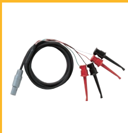
Universal RTD Adapter