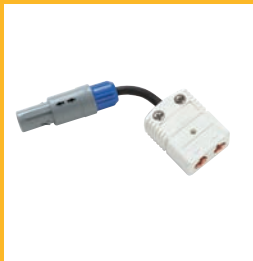
Universal Thermocouple Adapter