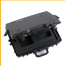
Probe and Readout Case