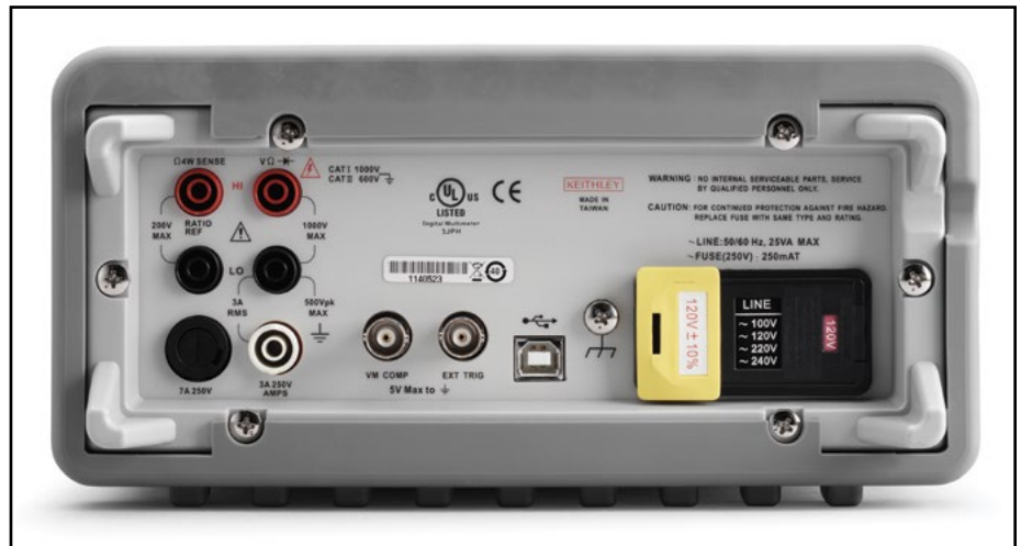
Model 2100 rear panel

AC CMRR: 70dB (for 1kΩ unbalance LO lead). POWER SUPPLY: 120V/220V/240V. POWER LINE FREQUENCY: 50/60Hz auto detected. POWER CONSUMPTION: 25VA max. DIGITAL I/O INTERFACE: USB-compatible Type B connection. ENVIRONMENT: For indoor use only. OPERATING TEMPERATURE: 5° to 40°C. OPERATING HUMIDITY: Maximum relative humidity 80% for temperature up to 31°C, decreasing linearly to 50% relative humidity at 40°C. STORAGE TEMPERATURE: -25° to 65°C. OPERATING ALTITUDE: Up to 2000m above sea level. BENCH DIMENSIONS (with handles and feet): 112mm high × 256mm wide × 375mm deep (4.4 in. × 10.1 in. × 14.75 in.). WEIGHT: 4.1kg (9 lbs.). SAFETY: Conforms to European Union Directive 73/23/ECC, EN61010-1, UL61010-1:2004. EMC: Conforms to European Union Directive 89/336/EEC, EN61326-1. WARRANTY: One year.